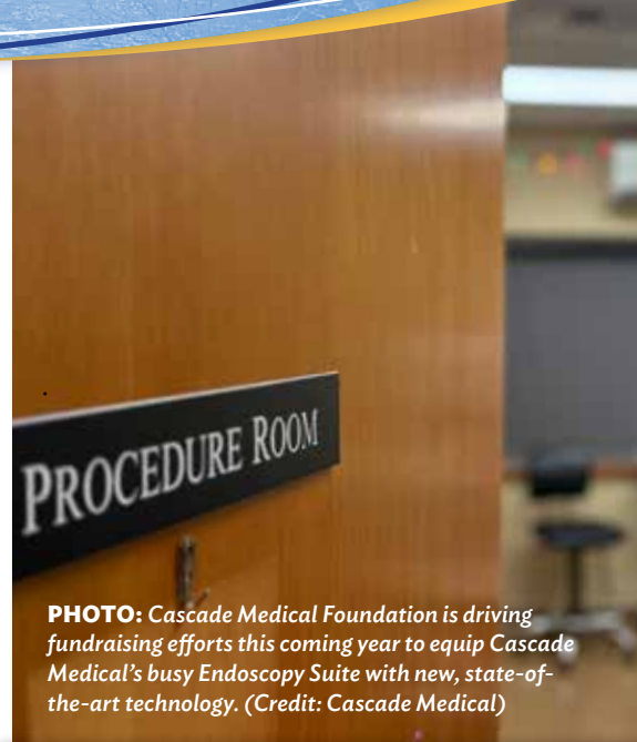
PHOTO: Cascade Medical Foundation is driving fundraising efforts this coming year to equip Cascade Medical’s busy Endoscopy Suite with new, state-of-the-art technology.