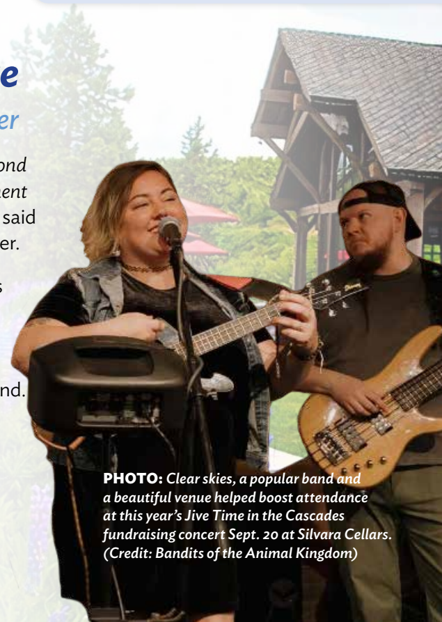
PHOTO: Clear skies, a popular band and a beautiful venue helped boost attendance at this year’s Jive Time in the Cascades fundraising concert Sept. 20 at Silvara Cellars.

This marks CMF’s second successful project of 2025. At the Marson and Marson Cascade Golf Classic in June, the Foundation completed fundraising for the $80,000 “Clinic Bundle.”