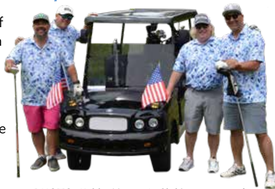
PHOTO: Kahler Mountain Club's team, one of 30 teams participating in the tournament, poses for a fun photo during the 2025 Cascade Golf Classic.

The 2025 Marson and Marson Cascade Golf Classic at Kahler Mountain Club raised $52,000, setting a record for the 22nd annual event thanks to our generous sponsors, willing participants — and with the help and hard work of dedicated volunteers.